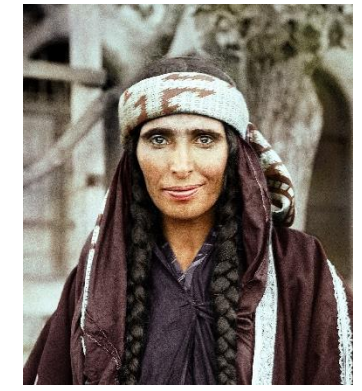
Bedouin women today live lives similar to women of the OT. This colorized photo of a Bedouin woman from c. 1900 reveals her strength and confidence.